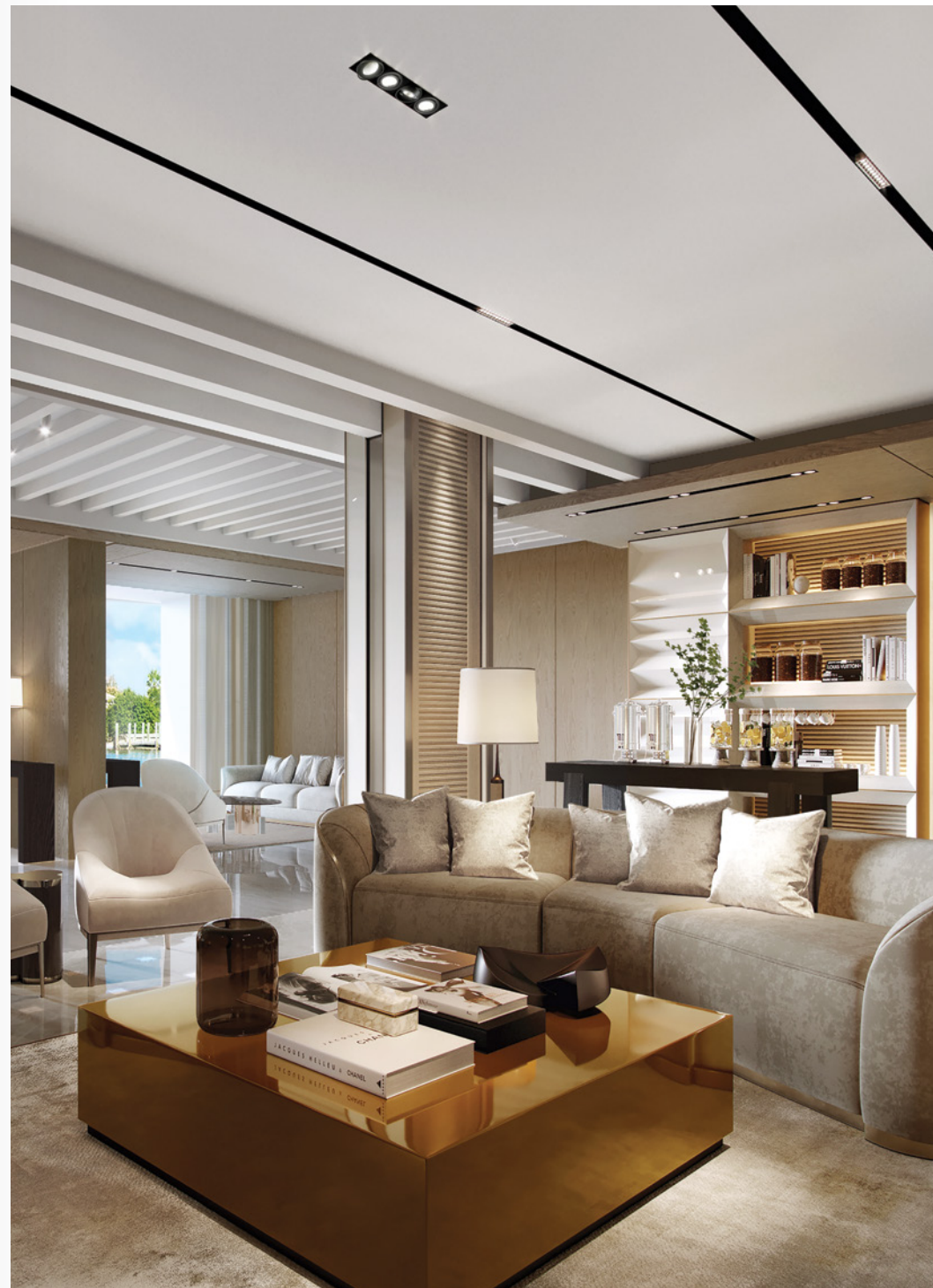
In the waterfront lounge, maritime-inspired materials and a refined palette of colors exude a relaxed aura of coastal calm for residents and guests.

In tandem with the distinguished courtesies of anticipatory service, this suite of masterfully-choreographed amenities not only accommodates, but elevates most any desire; transforming comfort and convenience into an exceptional experience in living.